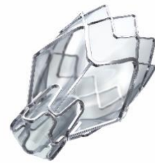
Zephyr Valve